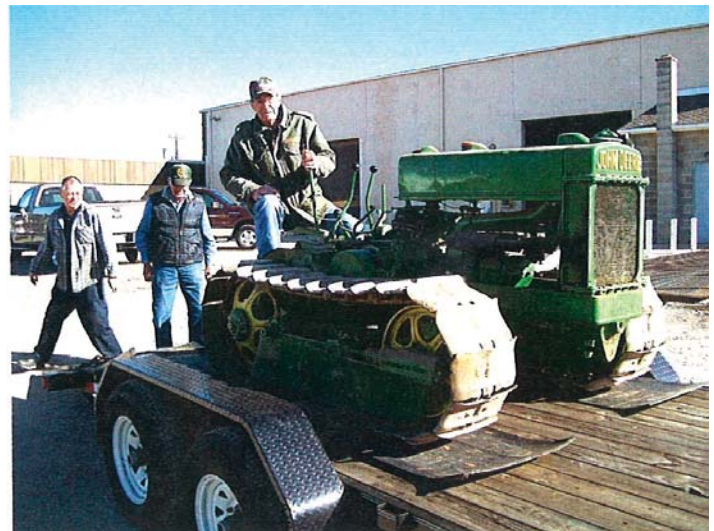
Loading for the ride to our engine shed