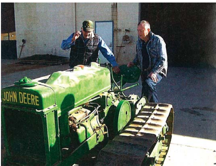
Blace and Bruce discussing the warranty