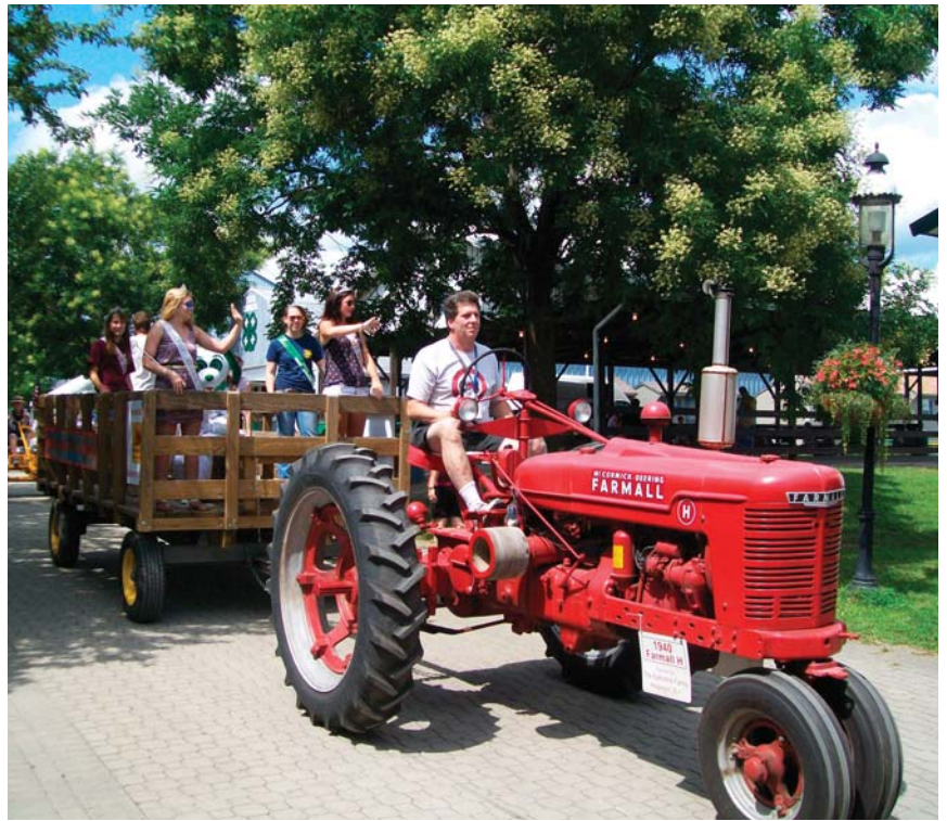
Tractor parade at the fair