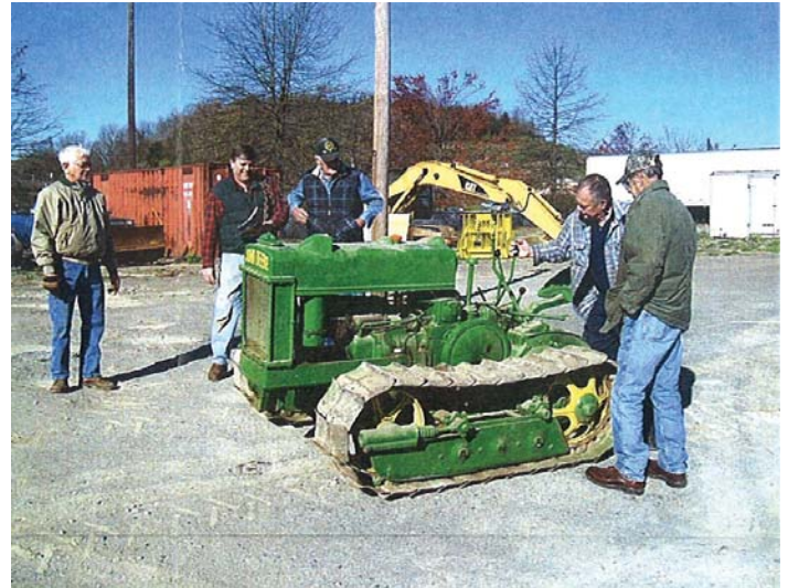
Bruce is giving shifting instructions